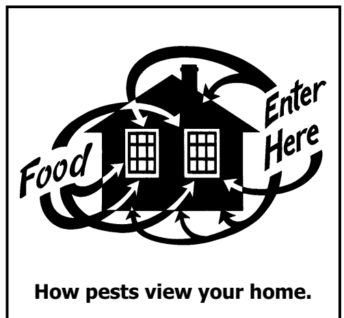
How pests view your home.

Place weather stripping on the bottom, side, and top of all outside doors—anywhere where you see light coming in. Old weather stripping may no longer be making a good seal, and it may be time to remove and replace it. Good weather stripping can help keep out pests, as well as cold air.